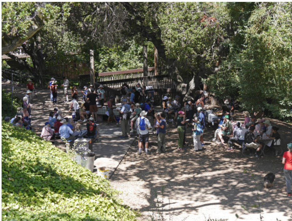
Berkeley Path Wanderers Association celebrated 25 years of paths-love with a celebration at Live Oak Park on Aug. 6.