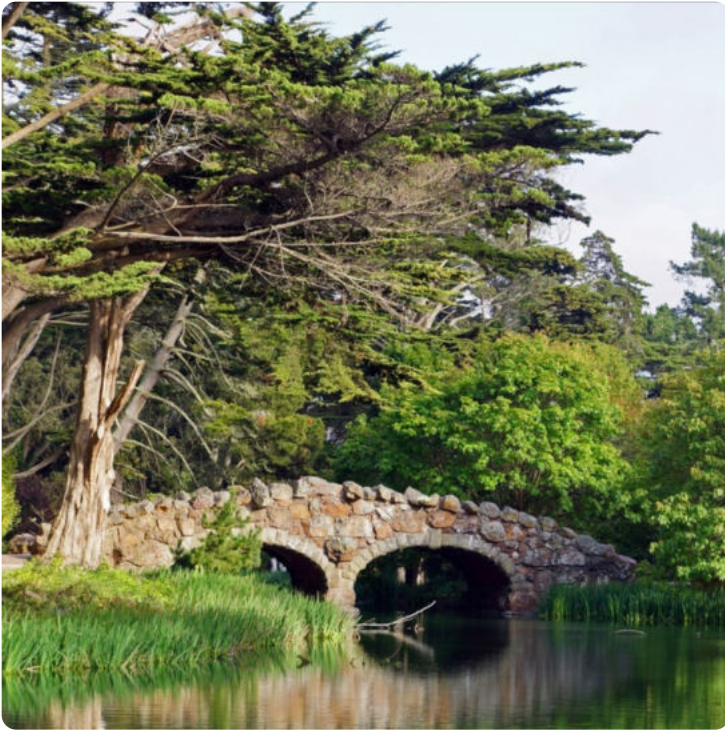
Stow Lake in San Francisco's Golden Gate Park is a stop on leg 2 of BPWA's multi-month Crosstown Trail adventure.