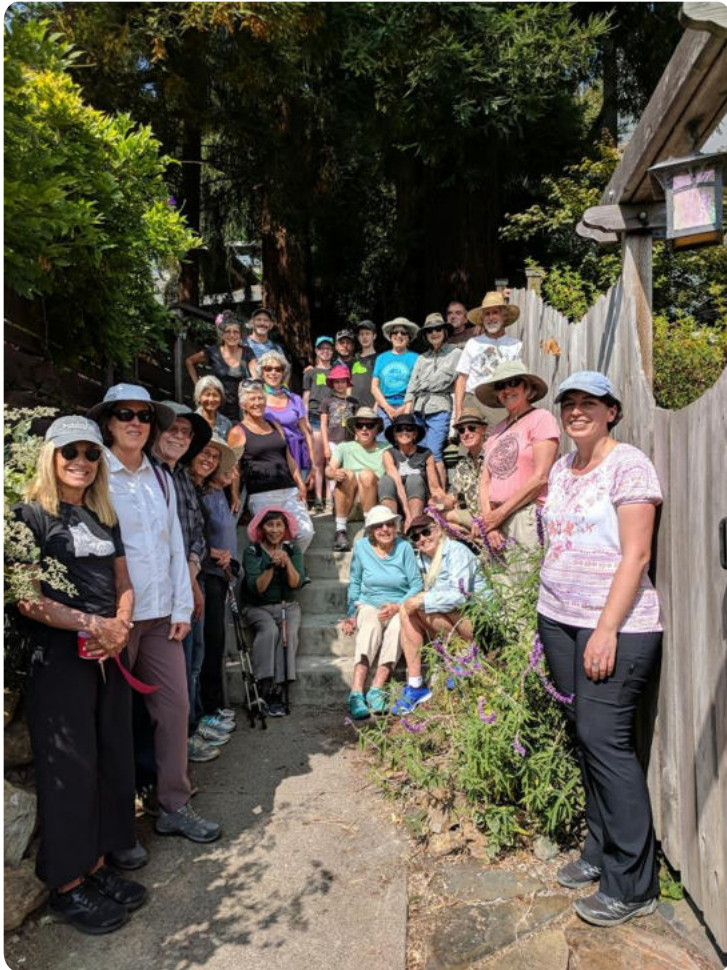
Board members and walkers celebrate the opening of the Path Wanderers' Handrail Corridor.

Mark your calendars for BPWA's annual meeting on Thursday, Oct. 17, 6 to 7:30 p.m. at the Hillside Club, 2286 Cedar St. All are welcome. Check your email for additional information in the coming weeks.