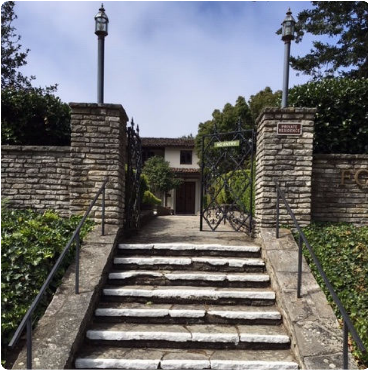
The chapel at Zaytuna College, the first accredited Muslim undergraduate college in the United States.