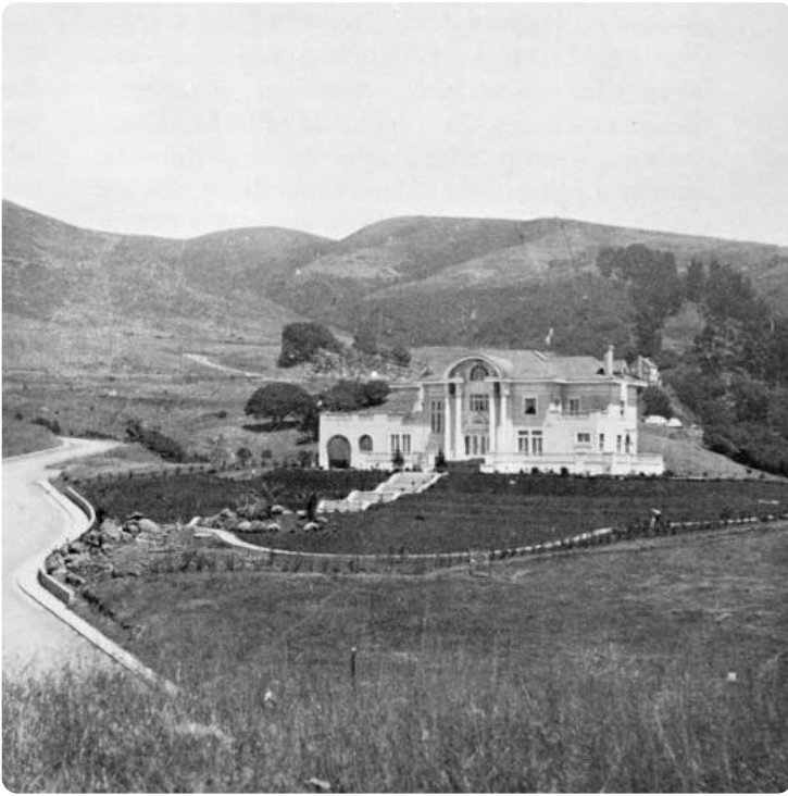
Hind House at 208 The Uplands, in 1909.