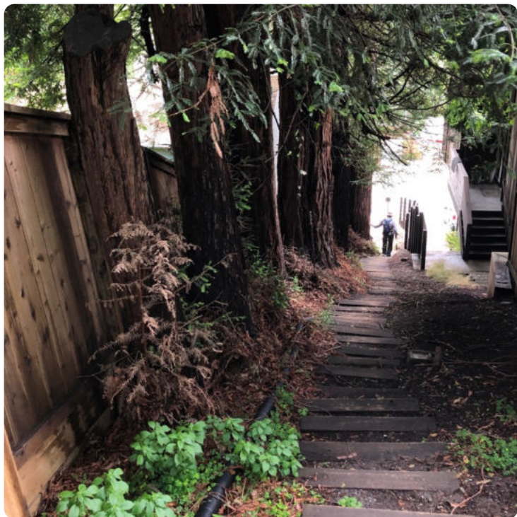
El Mirador Path could serve as an escape route in case of a disaster in the Berkeley Hills.