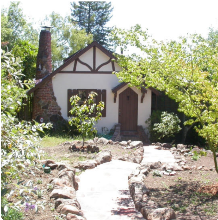
A storybook-style house at 850 Keeler St. in Berkeley's Cragmont neighborhood.

Sun., Oct. 27; Sat., Nov. 16; and Sun., Dec. 15.