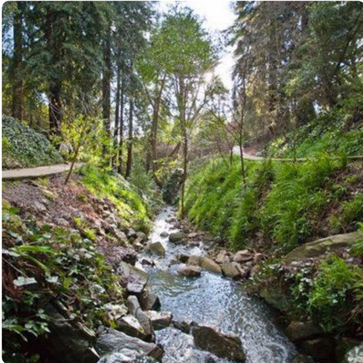
A network of paths alongside Bushy Dell Creek in Piedmont Park.

Join us on our terrific guided walks, which are free and open to all. Unless otherwise noted, they last 2 to 3 hours and proceed at a moderate, conversational pace. We're sorry, but we can't accommodate your dogs except on walks specified as dog-friendly. Please check our home page for last-minute weather cancellations. Questions about a walk? Write walks@berkeleypaths.org .