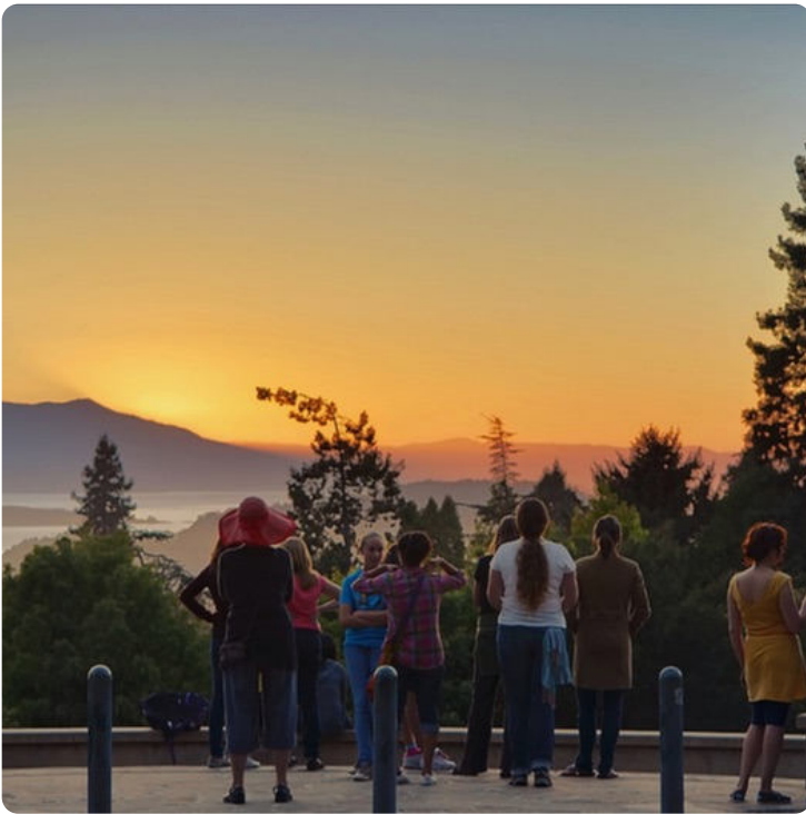
Sunset at the Berkeley Rose Garden.

Join us on a visit to Oakland's Rose Garden and a hike through Piedmont's posh neighborhoods and beautiful parks. Like Berkeley, Piedmont is crisscrossed by many staircases and hidden paths. We'll explore about a dozen of these all over town, including a beautiful redwood and oak path off Moraga Avenue that few know about. We'll also walk in Mark Twain's footsteps in Piedmont Park and meander through beautiful Dracena Park, the site of an old rock quarry. In all, this is a 5-mile loop with 800-foot elevation gain. There are a couple of back-to-back staircases that are sure to get our hearts going. We'll take breaks as needed and keep a comfortable pace to enjoy the sights and the conversation.