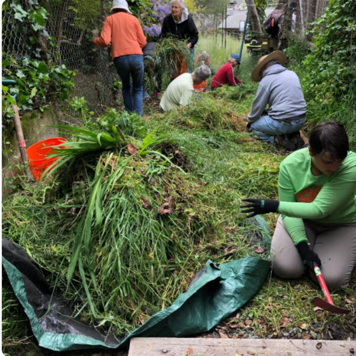
Path Wanderers volunteers clear out the biomass from John Muir Path.