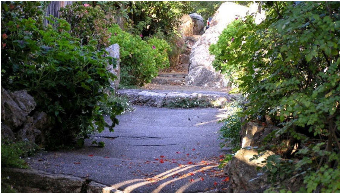
El Paseo Path in North Berkeley's Thousand Oaks neighborhood.

— Robert Macfarlane, The Old Ways: A Journey of Foot