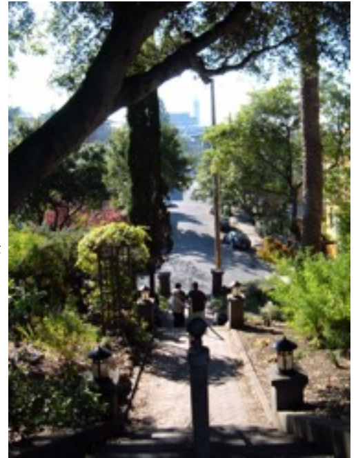
Looking down the steps toward campus

You might visit the new lamps as part of an evening stroll, or perhaps some sunny day in the early spring you'll want to visit this path, only four blocks from campus, just for the daffodils.