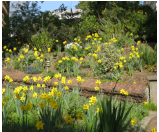
The exuberant daffodil bloom last spring

Tax-deductible household memberships in the BPWA are $5.00 and cover one calendar year. Benefits include a newsletter and other BPWA mailings and emails. If you can give more, please consider a donation. You can join or donate online at www.berkeleypaths.org or by sending this form and a check, payable to our fiscal parent BPPF (Berkeley Partners for Parks) to: