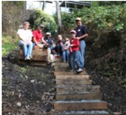
LaLoma Path, BPWA's current project

Handrails: BPWA is adding handrails to steeper paths. Last year middle Glendale and Shasta Paths got much-needed handrails, and we look forward to installing more each year.