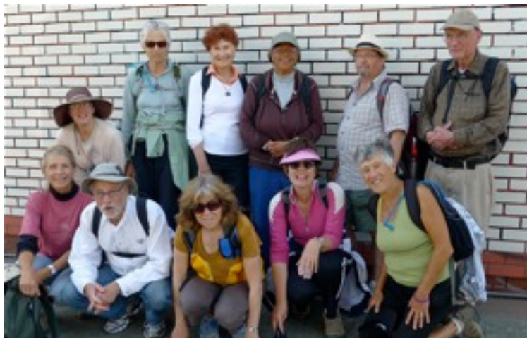
Pictured above is the intrepid group that finished the entire 13 miles of the 2nd annual Long Walk on Sunday, October 9th. Many others joined for part of the route. This all-day walk started at El Cerrito BART and went over Albany Hill and through Pt. Isabel, the Bay Trail, Albany Bulb, East Shore Park, Aquatic Park, Siterma District. The Santa Fe Right of Way led us to the end at North Berkeley BART. On the right are more photos from the event.

The Berkeley Path Wanderers Association, an affiliate of Berkeley Partners for Parks, is a volunteer group of community members who have come together to increase public awareness of the city of Berkeley's pathways. Our activities include guided path walks, the mapping of Berkeley's path network, the building of paths that are proposed, and the restoration of those that need maintenance.