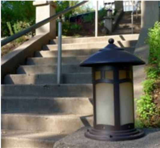
One of the new lamps on the Le Roy Steps

When Berkeley's Le Roy Avenue was being built 100 years ago, the last half block leading up to Hilgard was too steep for a road. The developers ended Le Roy Avenue in the middle of the block and installed a graceful stairway with brick ramps between each course of steps.