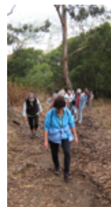
Clockwise from above: Point Isabel. The swing on Albany Hill. Sculpture at Albany Bulb. Climbing Albany Hill.