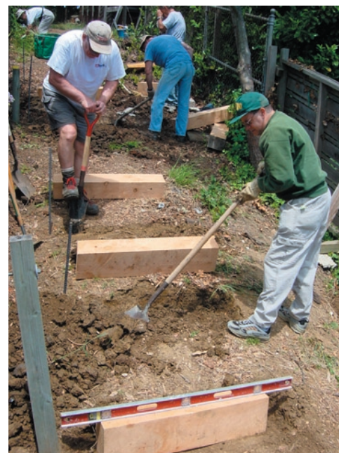
Neighbors and Berkeley Path Wanderers Association members added steps to the middle section of Stoddard Path on July 19th. This followed three earlier work parties over the last couple of months. Transformation has been amazing. When CalCorps students arrived for the first work party they looked uphill at a mess of ivy, weeds and tangled berry bushes.

■ Document the paths and their history, and BPWA's accomplishment for presentations to other groups. We would like to involve a broader level of community storytelling about the paths and begin compiling a photographic record of the paths. Perhaps a newsletter issue could be entirely devoted to community members recounting path tales.