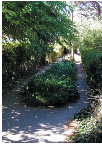
Ardmore Path near Oakland's Trestle Glen neighborhood.