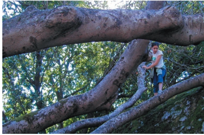
Mortar Rock Park near Indian Rock Park in the Berkeley Heights neighborhood.