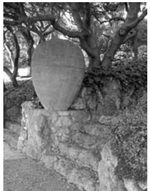
A stone urn marks the bottom of Indian Trail which leads upward to Great Stoneface Park.

Many of the pathways join parks and make them more accessible. Our interests require treasured open spaces to be kept usable and beautiful. Measures S & W can do that.